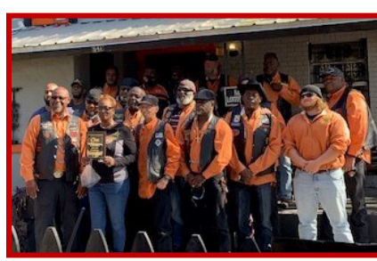
Thank you to Sunchasers for your generosity. Congratulations on your award!

The Sunchasers Motorcycle Club was chosen as FBH's Partner of the Month.