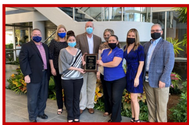
Stellar Foundation Board Members with the Business of the Month plaque. Congratulations on your award!

Food Brings Hope recently recognized Stellar Foundation as the February Business of the Month. For the last four years, Stellar has produced holiday cards, featuring outstanding FBH students, that they sent to their clients. The cards contained a message that they would make a donation to Food Brings Hope to assist them in meeting their mission to nourish the bodies, minds, and spirit of our community's children. Stellar also supported FBH by donating over $10,000 to purchase freezers for FBH programs so that frozen food could be added to the weekly Feed-A-Family food bags. The Stellar Foundation is also a proud sponsor of Food Brings Hope's annual Pearls of Hope Gala.