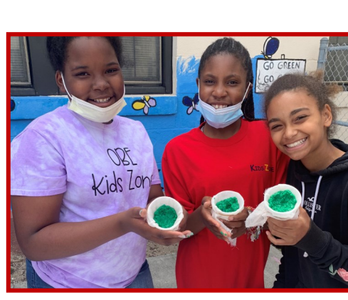
Ormond Beach Elementary KidsZone students making seed bombs to plant on their school campus.