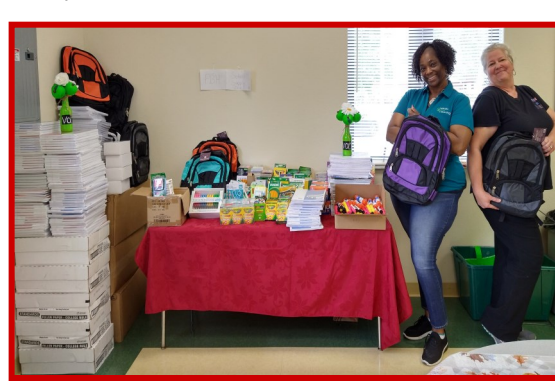
FBH appreciates VOL Counselors for their continued support of FBH and their programs.

This generous donation ensures that FBH students will begin the school year with the supplies they need to be successful.