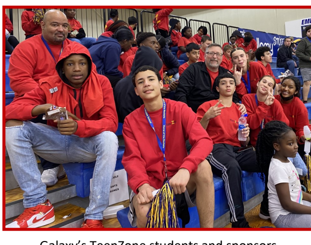
Galaxy's TeenZone students and sponsors