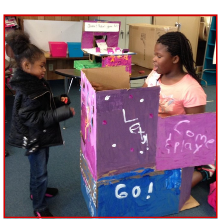
FBHonors students used the engineering process to design and build a cardboard arcade.