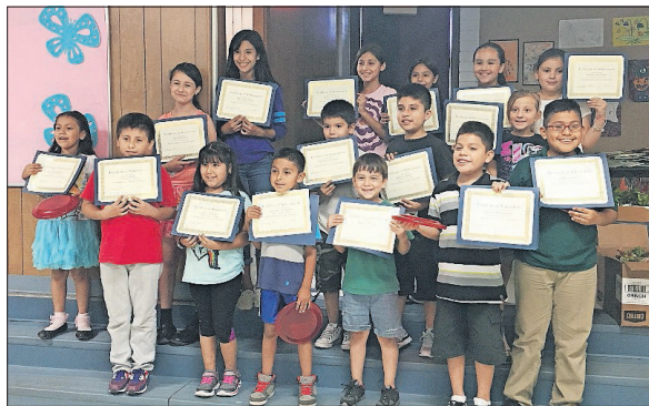
Children participating in the Pierson Family Literacy Program receive certificates and other goodies at the program's end-of-year celebration.

Each Tuesday night, selected students from Pierson Elementary and their families gathered in the elementary school's classrooms to participate in the Pierson Family Literacy Program. This two-generational program helps parents improve their skills in English plus reading and writing skills while their